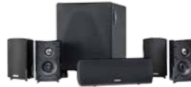
ProCinema 600 System (available in black and white)

4 – ProMonitor 600 Compact Main or Surround Speakers