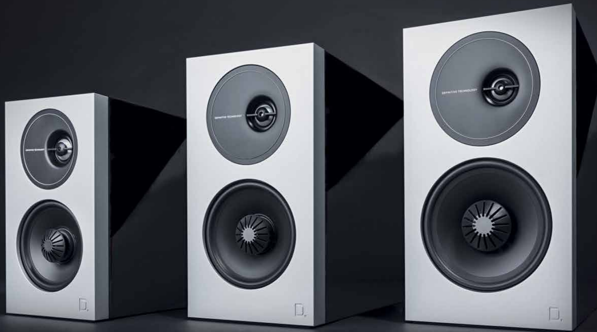
DEMAND SERIES HIGH-PERFORMANCE BOOKSHELF SPEAKERS