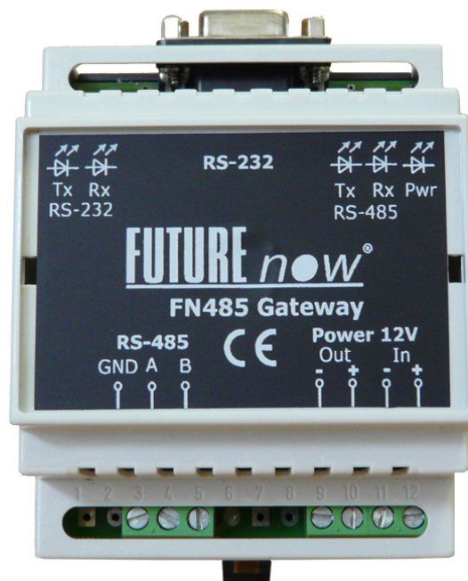
Figure 1. The FN Gateway